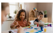
EARLY CHILDHOOD EDUCATION & CARE