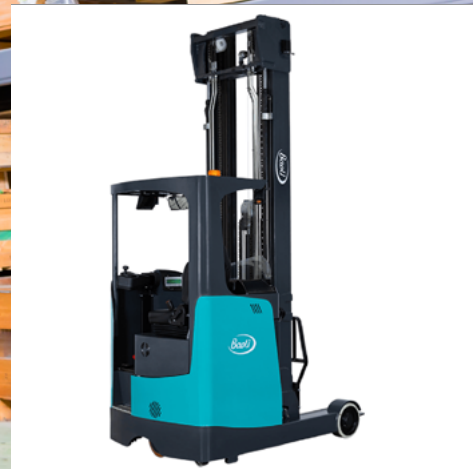
HIGH REACH FORKLIFT

INCLUDES BOTH COUNTERBALANCE AND HIGH REACH FORKLIFT TRAINING