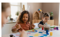
EARLY CHILDHOOD EDUCATION & CARE